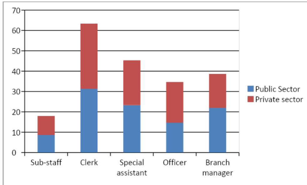
Figure 1.2: Employment Status of Sample Respondents

From Table 1.2 it is induced that out of 300 example respondents 31.67 percentages of the respondents are working as Clerks, 17.33 percentages of the respondents are Officers, 19.33 percentages of the respondents are working as Branch manager, 9 percentages of the respondents are Sub-staffs and 22.67 percentages of the respondents are working as unique right hand.