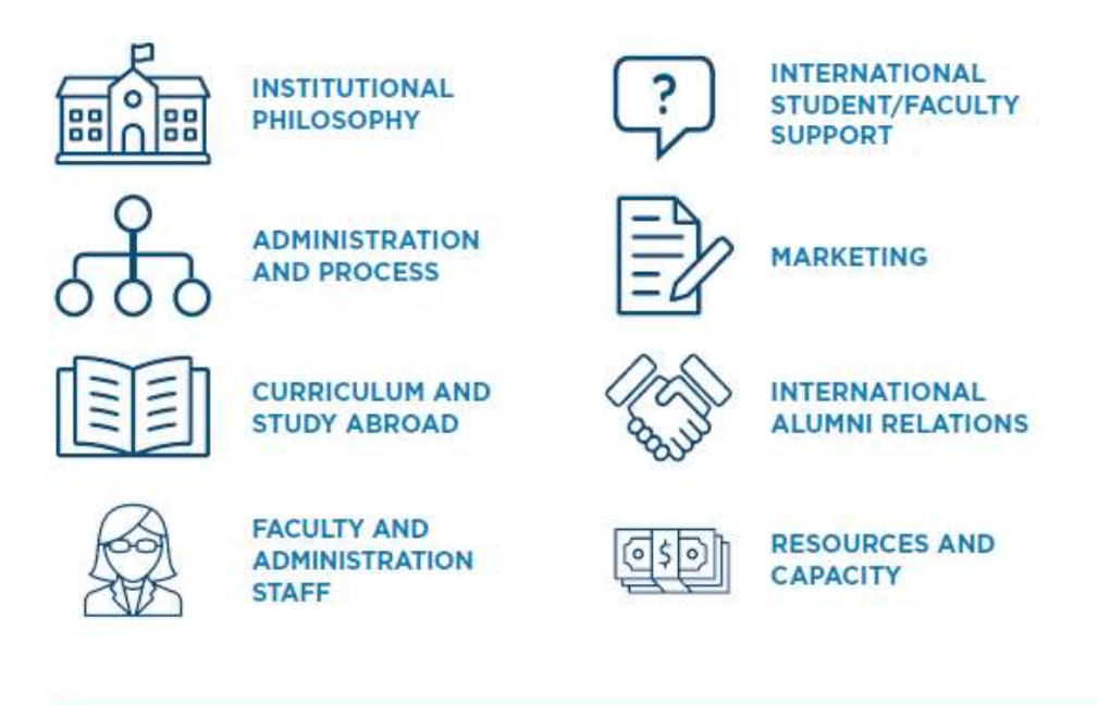
Pic. 1. Terry Rodenberg's Eight Aspects of Internationalization

The aspects presented are comprehensive for creating a transparent internationalization plan for any higher education institution and are acceptable in any state of the world. This "institutional imprint," according to the creator of the model, helps the institution of higher education to identify the variation in the areas in which internationalization should be carried out. It also acts as a motivator for change, renewing and optimizing the work of a higher education institution.