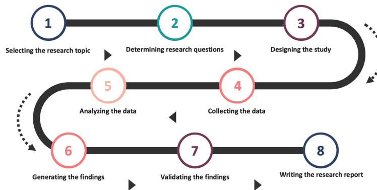
Figure 1. Research process