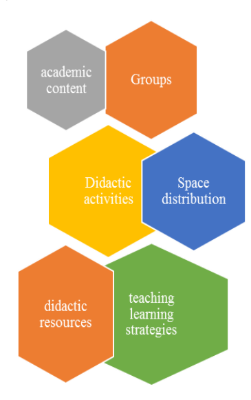
Figure 1. First level categories obtained with the analysis

The resulting categorical system derives from the raw information collected and presents a direct connection with the study objectives. In each of the subsections, the results extracted are deepened by means of the 2nd, 3rd or 4th level subcategories, depending on the case, from the analytical description carried out.